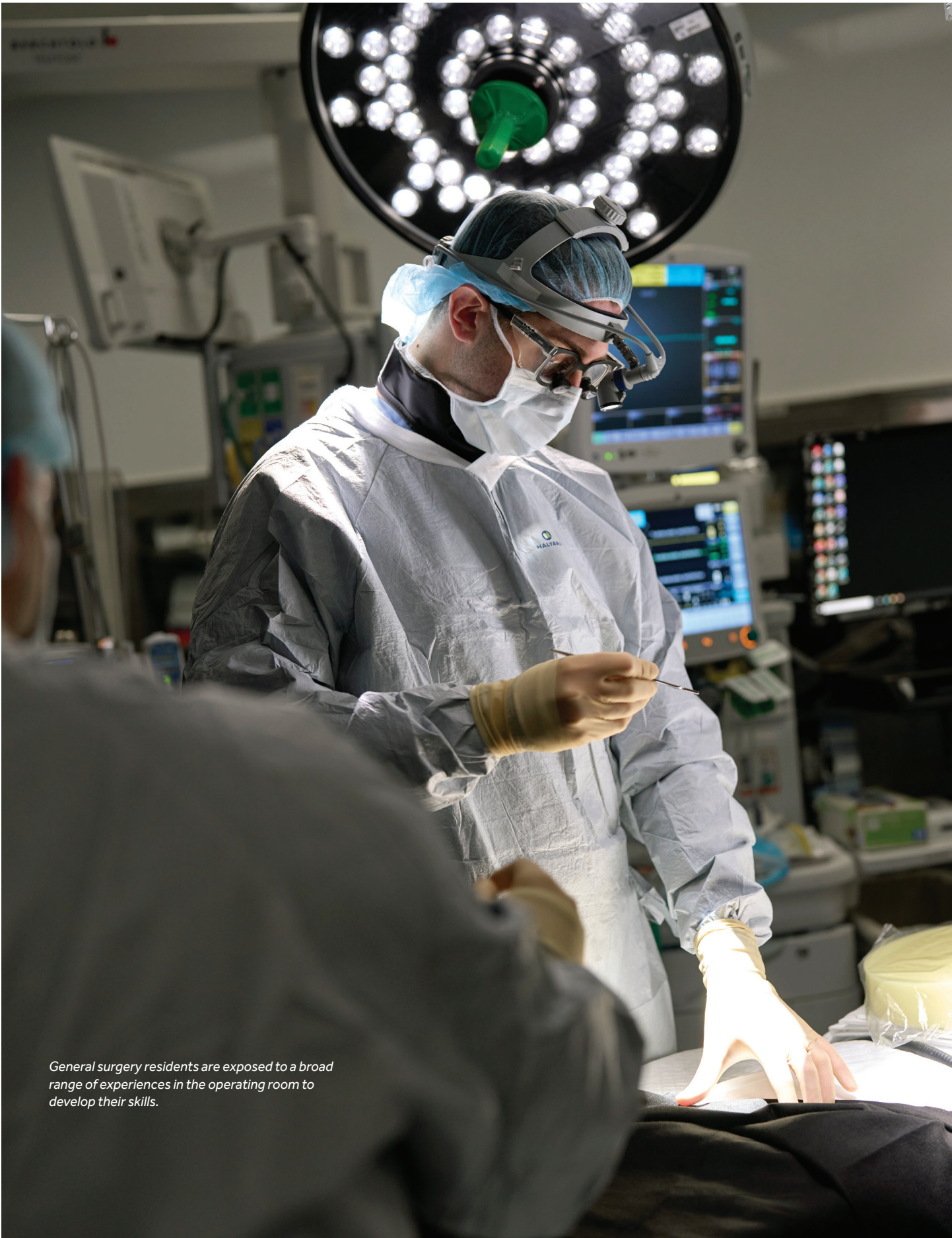
General surgery residents are exposed to a broad range of experiences in the operating room to develop their skills.