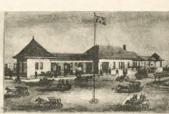
RUTHERFORD STATION, ERIE R.R.