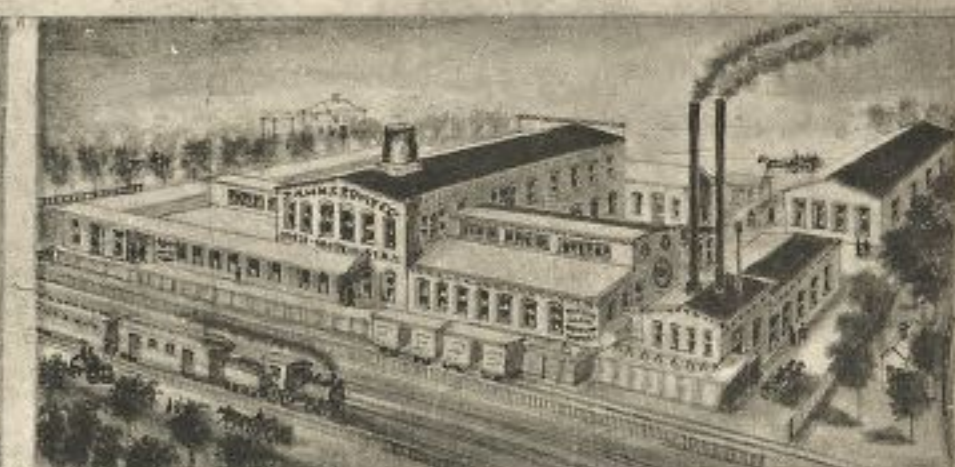
THE ZAHN & BOWLY CO., MFRS. OF BEVELED PLATE MIRRORS.