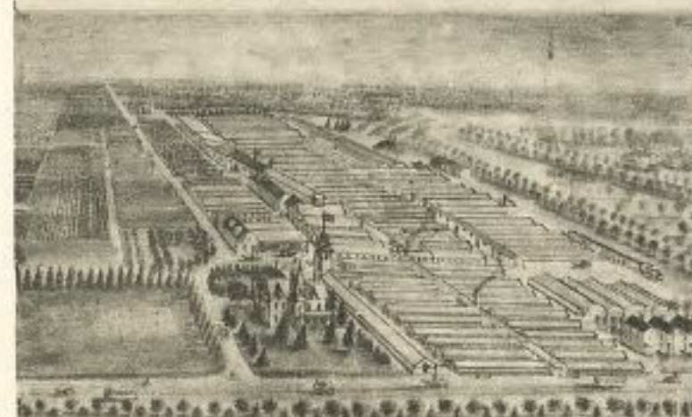
JULIUS ROEHR'S, FLORIST. EXOTIC NURSERIES.