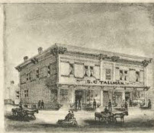
S. C. TALLMAN, PLUMBING AND HEATING.